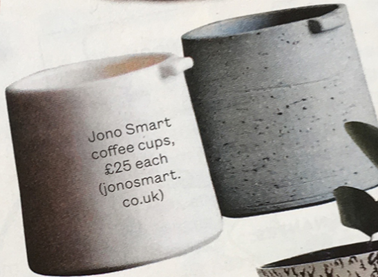
Jono Smart coffee cups, £25 each (jonosmart. co.uk)