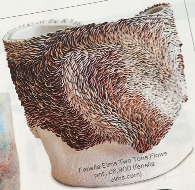
Fenella Elms Two Tone Flows pot, £6,900 (fenella elms.com)