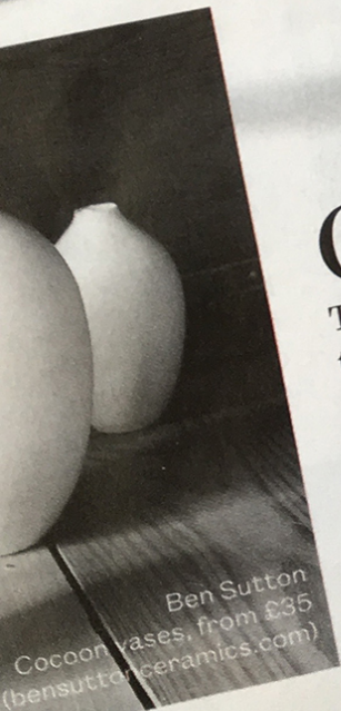
Ben Sutton Cocoon vases, from £35 (bensuttonceramics.com)

The British craft scene is flourishing – and, thanks to a rising number of passionate young potters, the smart money is on investing in ceramics this spring. We're craving pieces that serve a function but also stand alone as sculpture. What to look for? Organic structures, imperfections and minimal use of varnish – ageing, dripping and cracked edges are all on the agenda. Increasingly Londoners are leapfrogging the middle man and shopping directly from the artists' studios: the best assurance that your purchase is one of a kind. We recommend a visit to Hackney-based Ben Sutton, whose sleek Japanese x Scandi crockery will bring a new dimension to dinner time.